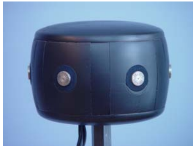
Figure 1 Current Prototype

The modular aspect of this design, flexible and variable in nature, is a unique property.